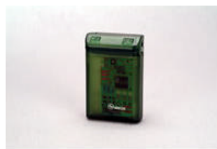
Hollow pager adapted to conceal drugs.