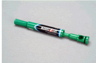
Felt tip marker with internal drug pipe.