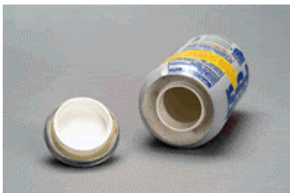
Soft drink can with false bottom.

How can drug paraphernalia be sold? It can be obtained through various means, including over the Internet and through mail-order businesses. Items are frequently sold at "head shops," tobacco shops, trendy gift and novelty shops, gas stations, and convenience stores. Drug paraphernalia are illegal.